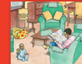
Ntate o tlhokometse lesea