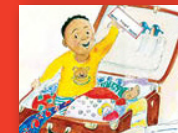
Ke ipaakanyeditse leeto