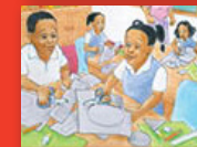
Setshwantsho sa popego