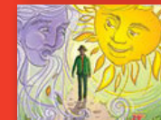
Kganetsano fa gare ga phefo le letsatsi