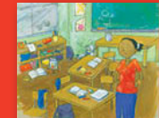
Tobekano e kana!