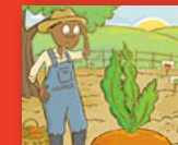
Segwete se segolo