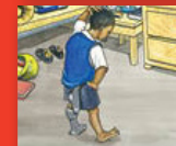
Kausu e e latlhegileng