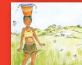
Neo o kae?