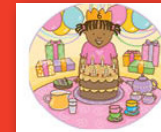
Selae sa bofelosa kuku