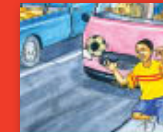
O tllile go dirang jaanong?