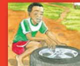
Ke leotwana la ga mang le?