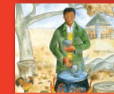
Sopo ya maje