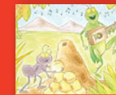
Tshoswane le tsiekgope