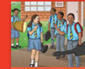
Co reetsa mmimo