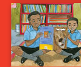
Tau le peba