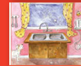
Ke mang yo o thubileng fensetere?