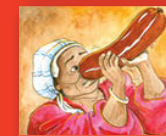
Dikeletso tse tharo