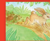
Mmutla le Khudu