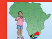
Aforika Borwa wa rona