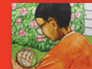
Ke leino la ga mang le?