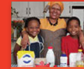
Re baka dikuku le nkoko