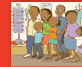
Lesedi o ya lebenkeleng