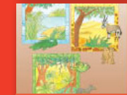
Go nna eng fano?