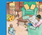
Ubaba usele nonana