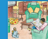
Tatana u sele na n'wana