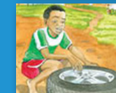
I vhlwa ra mani leri?