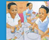
Dirowa u tsema