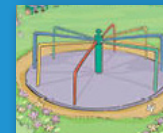
Xi famba hi xihatla