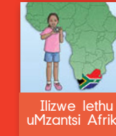
Ilizwe lethu uMzantsi Afrika