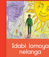
Idabi lomoya nelanga