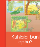
Kuhlala bani apha?